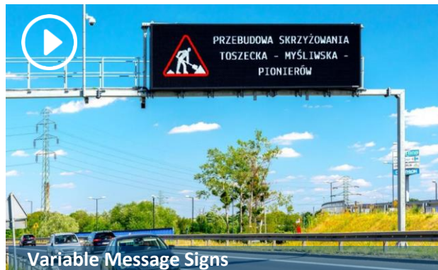
Variable Message Signs