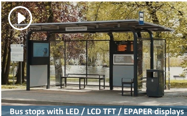
Bus stops with LED / LCD TFT / EPAPER displays