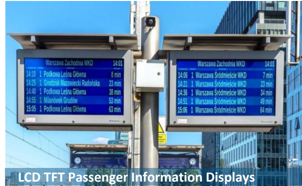
LCD TFT Passenger Information Displays