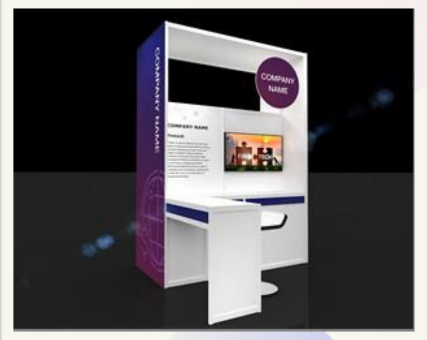
Note : Startups booth tentative design sample (not final version)