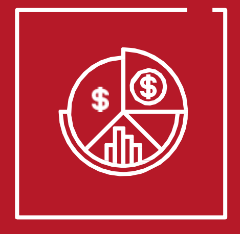
FACTS ABOUT THE POLISH FOOD SPECIALTIES SECTOR