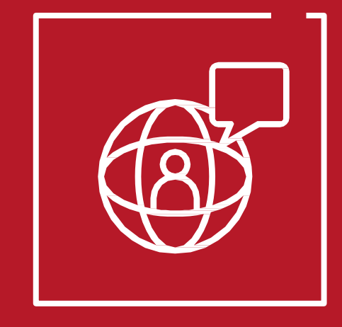
HOW WE CAN HELP YOU